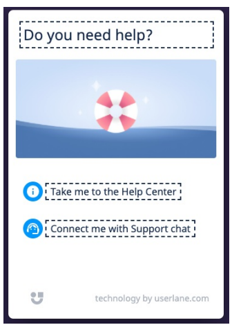
4. Click Save Your Changes.